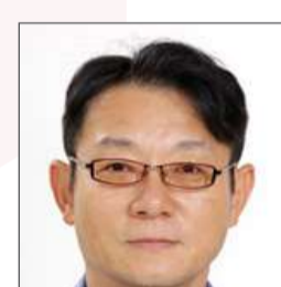
Gunny, HYOUNG South Korea EIDF/EBS International DOC Film Festival Executive Producer

※ Country name, alphabetical order(Overseas, Domestic)